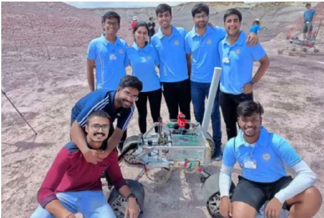
Team Inferno at Mars Yard Utah during URC 2022

Our team, Inferno, achieved a significant milestone in 2022 by successfully qualifying for one of the most coveted competitions, the University Rover Challenge 2022, held in Utah, United States of America. Amidst intense competition and numerous applications from around the globe, only 36 teams were selected for the highly-coveted on-site finals, comprising both national and international teams. This achievement underscores our team's exceptional skills and knowledge in the field of robotics.