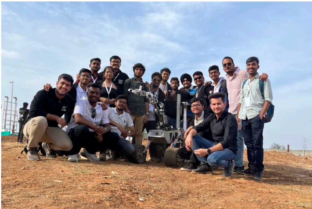
Team Inferno at IRC 2023

The Space Robotics Society successfully hosted the prestigious International Rover Challenge 2023 at Presidency University in Yelahanka, Bangalore in January 2023, drawing participation from numerous national and international teams. Our very own team Inferno's exceptional project management skills were duly recognised and acknowledged by the organising committee, resulting in a felicitation for "Best Project Management".